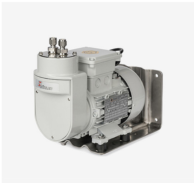
Sample Gas Pump P2.2 O 2 Atex

The manufacturing processes of H_2 need to be analytically monitored, with the focus of the exercise concentrating mainly on LEL and SIL compliance. Extractive gas analysis is the most ubiquitous analytical method used in these manufacturing processes. Residual moisture must be drawn out to protect and preserve the measuring cell and to avoid false readings before the sample gas reaches the analyser.