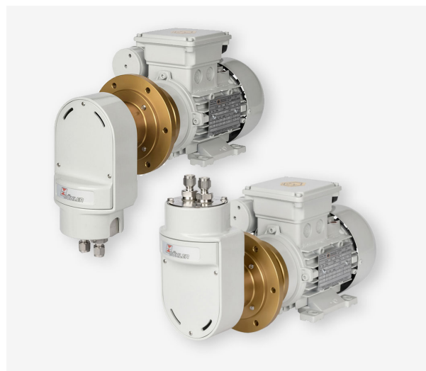
Sample Gas Pump P2.4 H 2 Atex

Since no particulate contamination is likely to be found in the sample gas during the electrolysis process, simple sampling points are sufficient, ideally at each outlet of a module. From these, the sample gas is drawn in by a special sample gas pump, which is also capable of conveying any condensate that may occur and fed to a sample gas cooler operating under slight over-pressure. When dimensioning the required flow rates, the lower density of hydrogen on the H_2 side must be considered so that it can be throttled to the correct flow rate upstream of the analyser. If there is already sufficient pressure and flow rate in the production process, the pump can be dispensed with. The moisture is separated in the cooler and the dry sample gas is fed into the analyser(s). The over-pressure in the sample gas prevents the ingress of external air and ensures unaltered measurement results. At the same time, the over-pressure